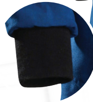
FR knit cuffs for added safety