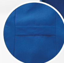
Waistband in back for a tailored fit