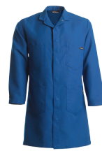
LAB COAT STYLES 351NX60 & 352NX60