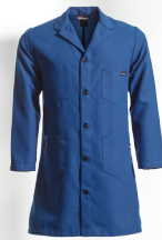
LAB COAT STYLES 350UT95