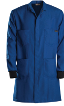
LAB COAT WITH KNIT CUFFS STYLES 357NX45 & 361NX45