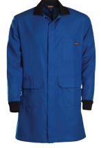
FR/CP LAB COAT STYLES 353CH45 & 354CH45